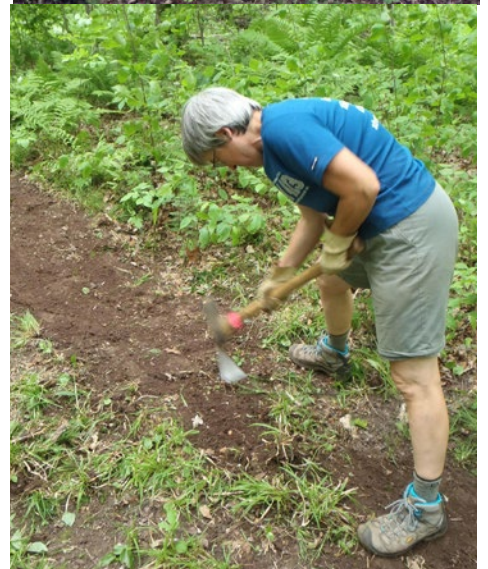
Building a new section of the North Country Trail between Stricker Road and Hwy 169 near Mellen, WI.