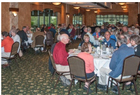
The Fox Valley Sierra Group celebrated our 35th year at the Pullmans Restaurant in Appleton.