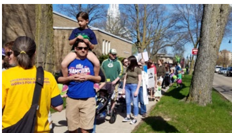
We rallied for Science at the Science March in Appleton