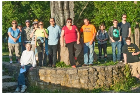
Eighteen people took part in a Summer Solstice hike at High Cliff.